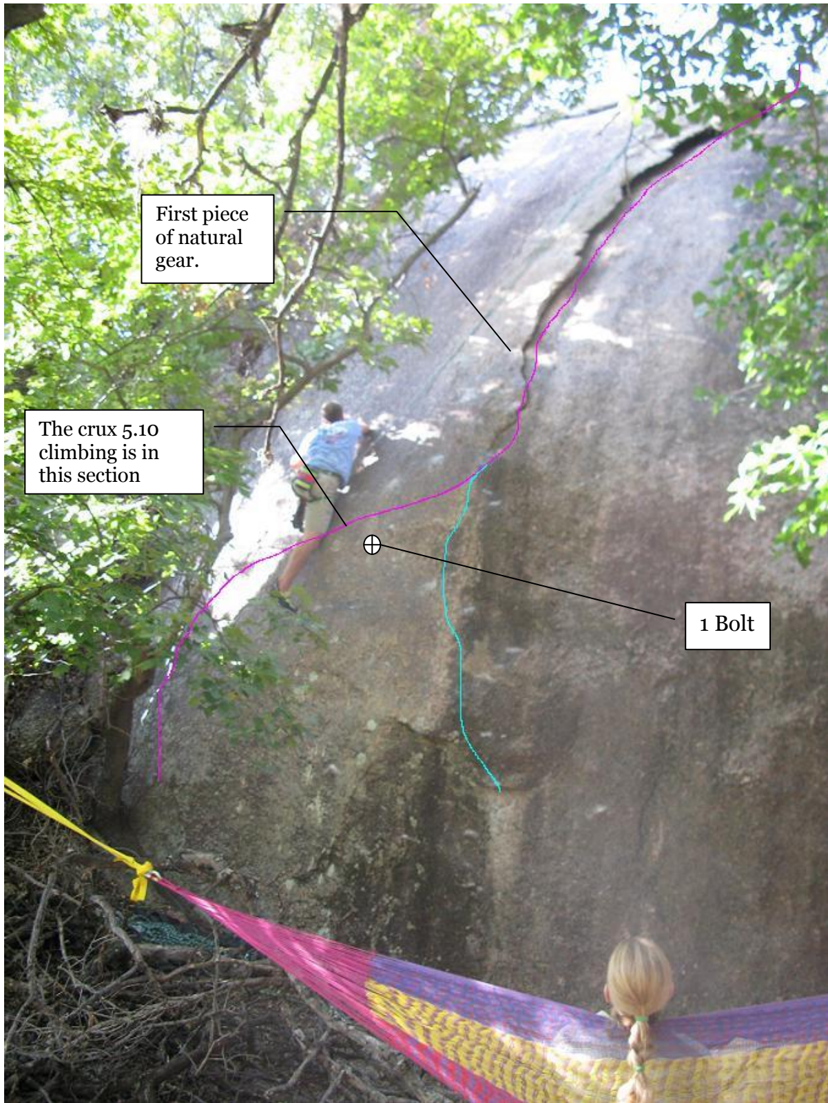
The Teal colored line is the Direct Start which looks 5.12 and will also be protected by this bolt. We hope to do it and name it "It's Time to Get III".